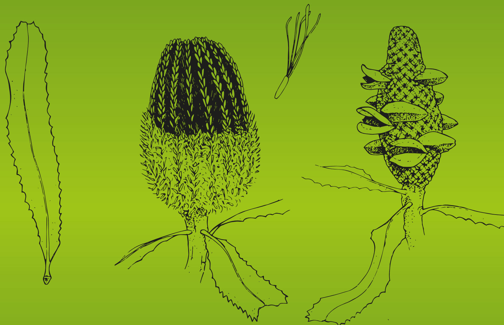
Firewood Banksia Banksia menziesii

Each showy, Banksia spike has over 200 flowers. As birds and insects visit the flowers, they transfer pollen, fertilizing the flowers which form large seeds inside Banksia cones. The seeds stored in eleven Slender Banksia cones can sustain a Carnaby's Black-Cockatoo for a day.